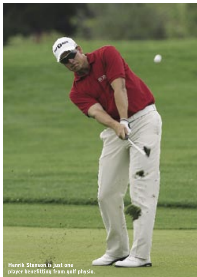
Henrik Stenson is just one player benefitting from golf physio.

About 12 years ago we started working at the Australian tournaments. We soon realised that most players were completely golf-training illiterate outside the institute, and we've probably